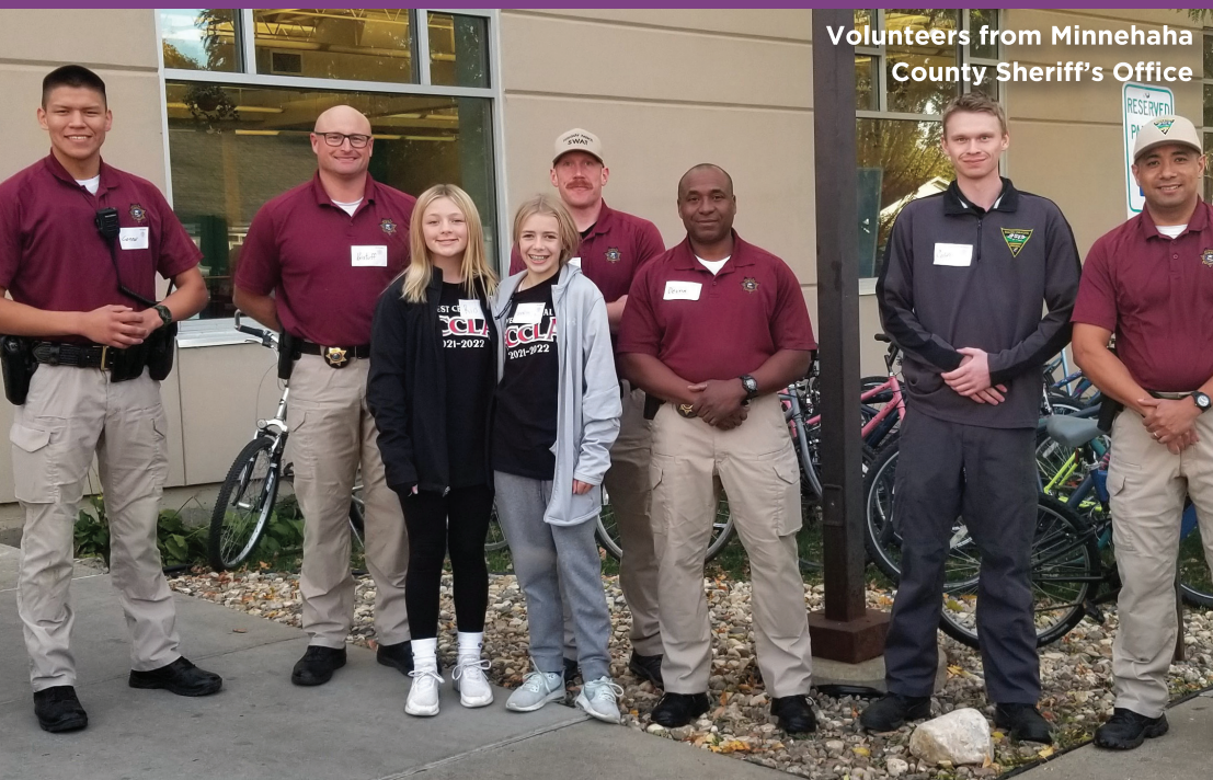
Volunteers from Minnehaha County Sheriff's Office

FEEDING BODY AND SPIRIT BY ENGAGING WITH OUR COMMUNITY!