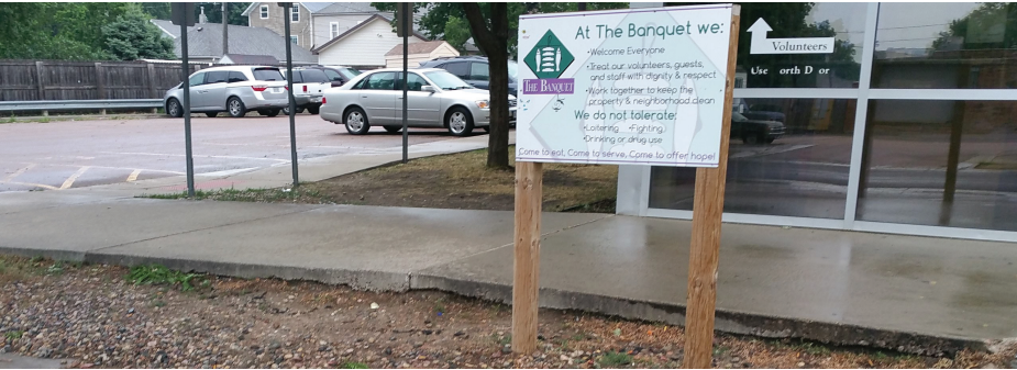
This space needs your help!